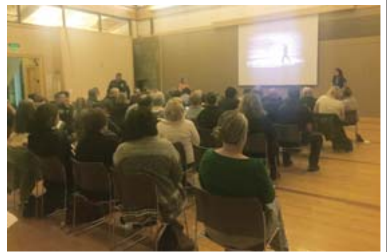
Residents and city staff listen to the presentation.

Residents have an overall posi-tive view of the Lafayette Police Department but there were still some people who felt that the concepts of implicit bias and all of embraced by members of the Lafayette community.